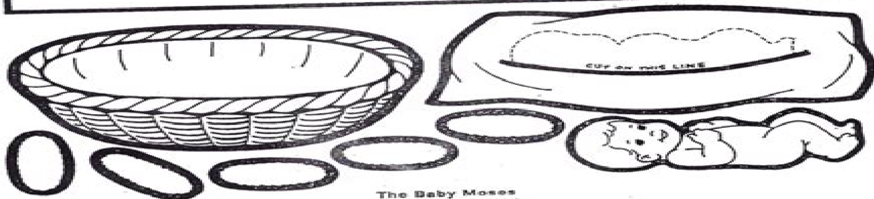
The Baby Moses Exodus 2:1-10

Paste in place the different parts of the picture that are missing: basket, blanket, baby, cattails.