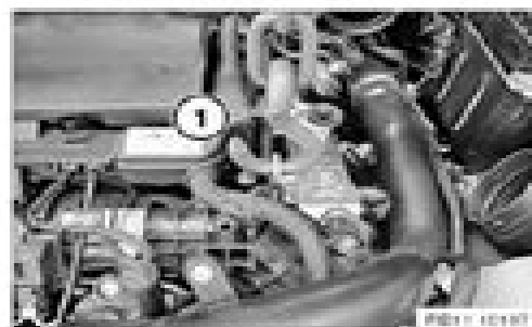
Fig. 13: Identifying Hook

Attach hook (1) 00 6 080 to suspension leg.