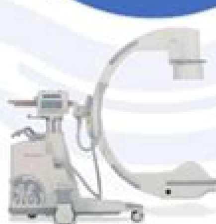
Super C 9" (23cm) (I)