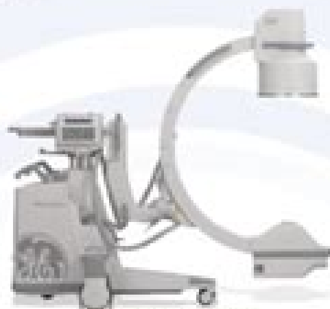
Standard C 12" (31cm) (I)