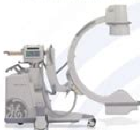
Standard C 9" (23cm) (I)