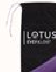
lavender eye pillow