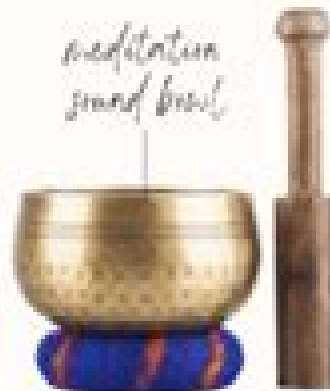
meditation sound bowl