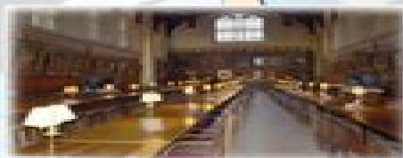
5. Christ Church Great Hall