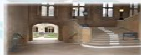
6. Christ Church Stairway (bottom)