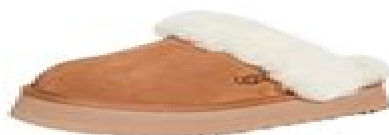
6. UGG SHEARLING SLIPPERS