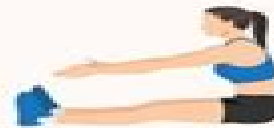
Roll ups 6 reps x 3 sets