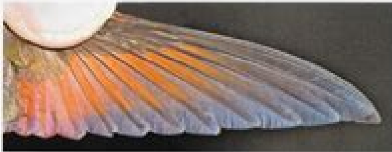
Adult male wing. The wing of the male shows more rusty orange than that of the female, extending into the ninth primary (p9) and almost to the tip of p1 and the first few secondary wing feathers.