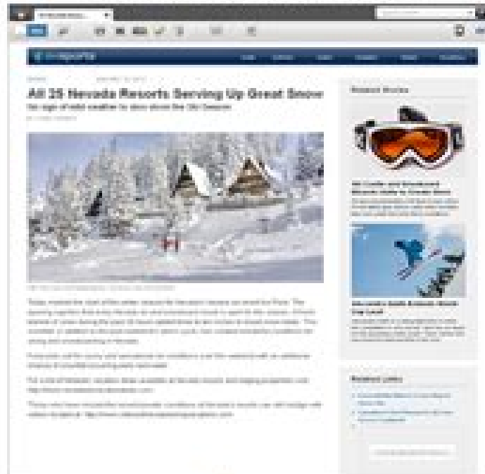
Web Mode: Web page view of a content entry form

Content entered into the content entry form (in Form Mode or Web Mode) is stored as a record in the CM system database.