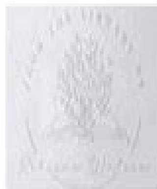
TOP SELLER - From the Library of Book Embosser Custom...