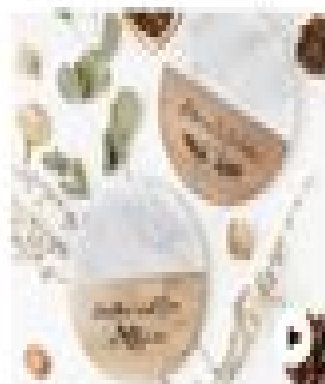
Custom Engraved Marble Wood Coasters | Round Marble...