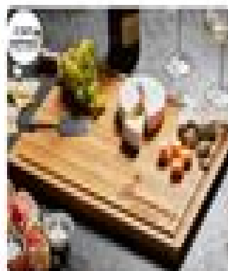
Personalized Cutting Board Wedding Gift, Customize your...