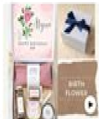
Birth Flower Birthday Gift Box, Personalized birthday ideas...