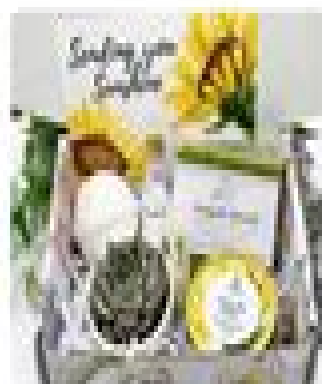
Thinking of You - Succulent Gift Box - Missing You - Friendship...