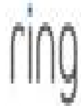
Ring Video Doorbell