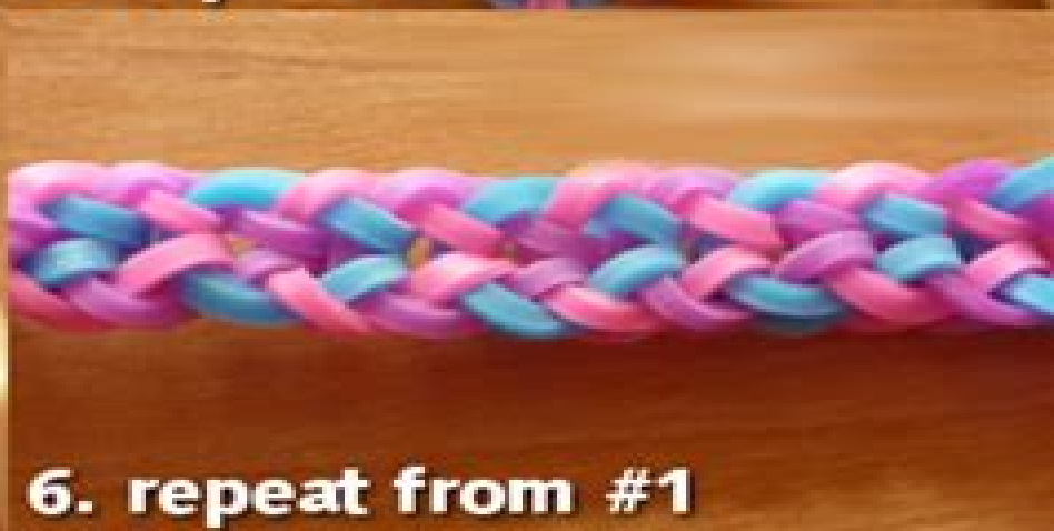
6. repeat from #1