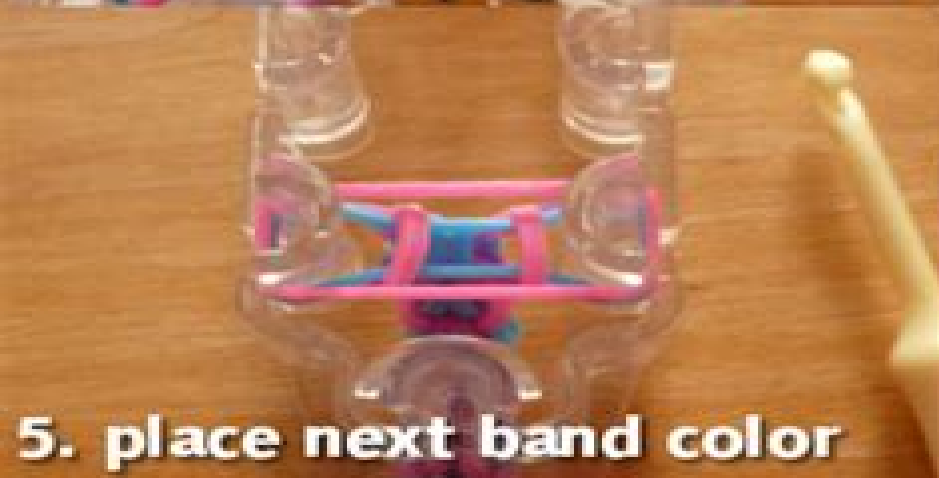
5. place next band color