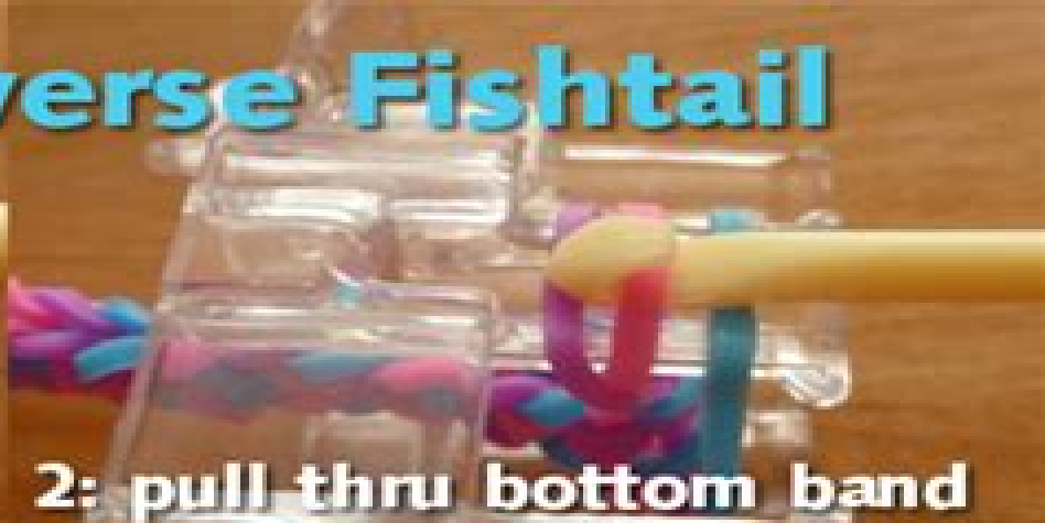
2: pull thru bottom band