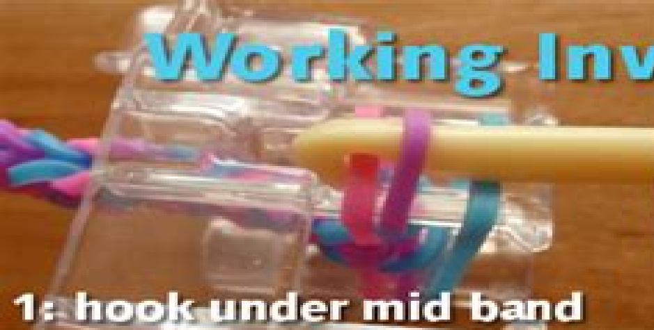
1: hook under mid band