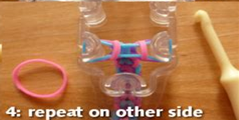
4: repeat on other side