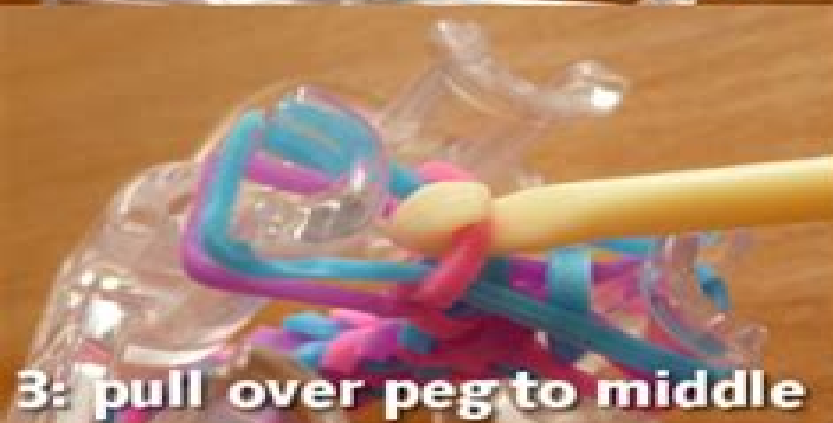
3: pull over peg to middle