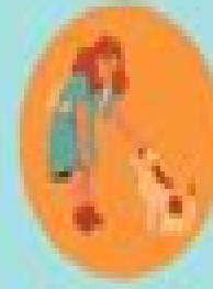
Spending Time With Pet & Animals