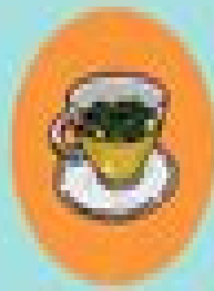
Drinking Herbal Tea