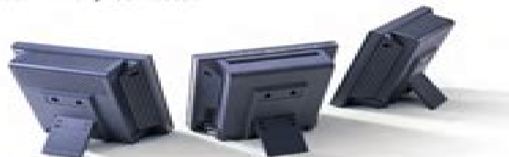
Easel-styled supports allow SoundSpace 5 to be angled when free standing. Keyholes are provided on each unit for wall-mounting.

The remarkable SoundSpace 5 system delivers stereo reproduction that rivals the concert-hall quality of full-sized Nakamichi components. Its three units, styled in contemporary brushed metal and acrylic, are designed to be arranged in a variety of ways - standing, tilted like easel frames, or even hung on the wall. Charcoal, blue or green speaker grilles are included for coordination with any room decor.