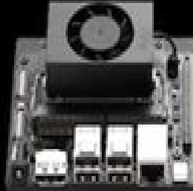
Jetson Orin Nano Developer Kit