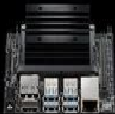
Jetson Nano Developer Kit