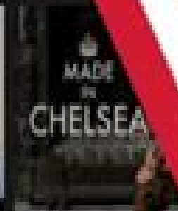
Made in Chelsea