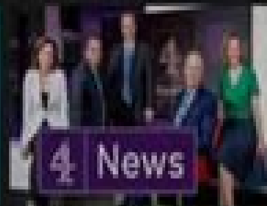
Channel 4 News