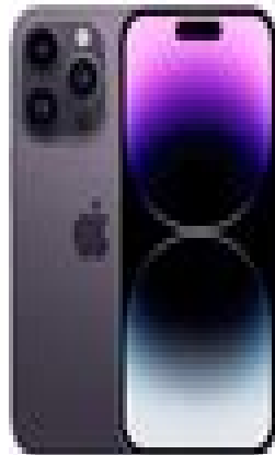
iPhone 14 Pro