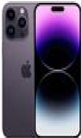
iPhone 14 Pro Max