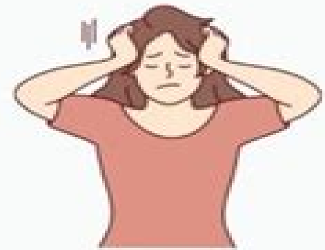
anxiety and overthinking