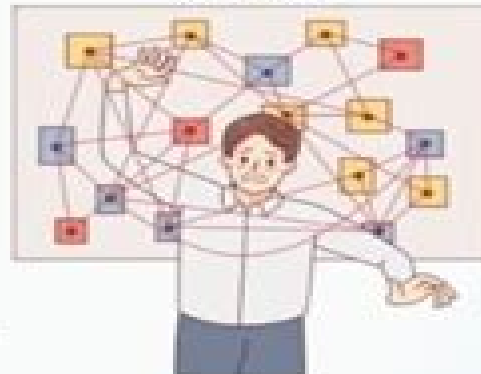
too many small tasks