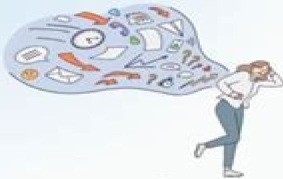
too much information