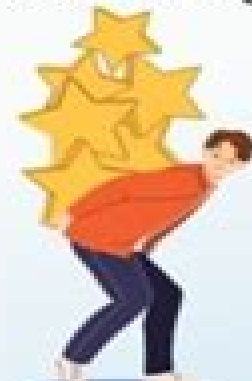
perfectionism and pressure