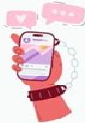
constant input from devices