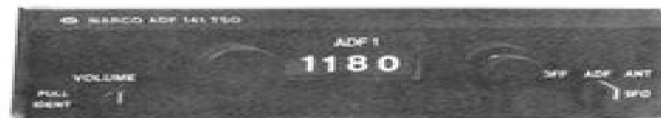
ADF 141 RECEIVER