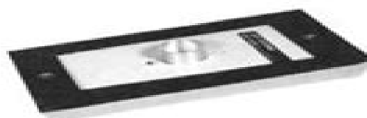
ADF 141 ANTENNA