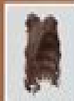
Ponyy Buns Hair (Brown)