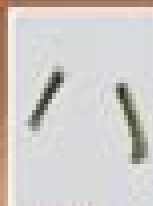
Knitted Arm Warmers Green