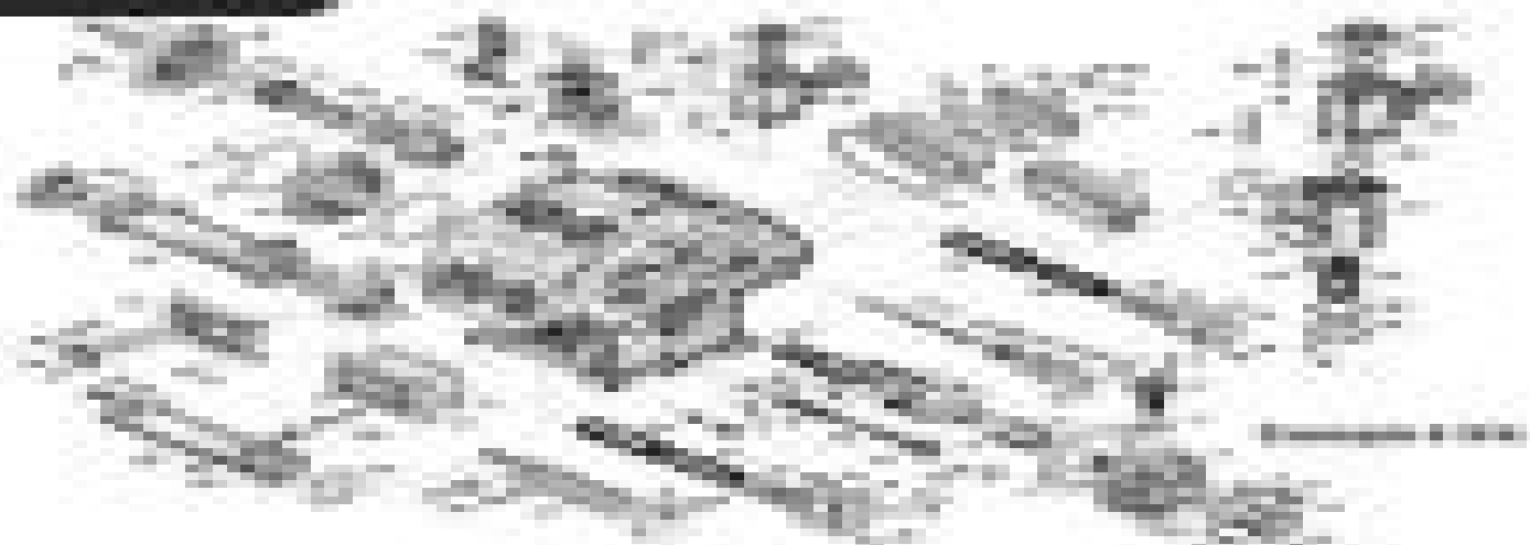
001 Compressor Assembly, Exploded view