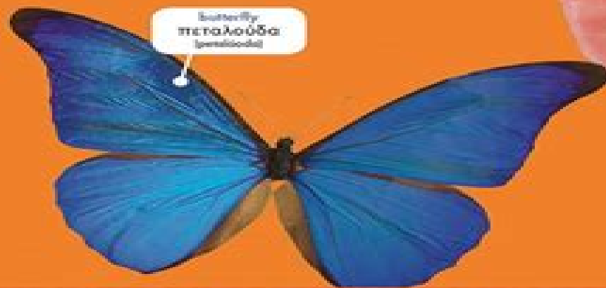
butterfly ΠΕΤΑΛΟΥΔΑ (petalouda)