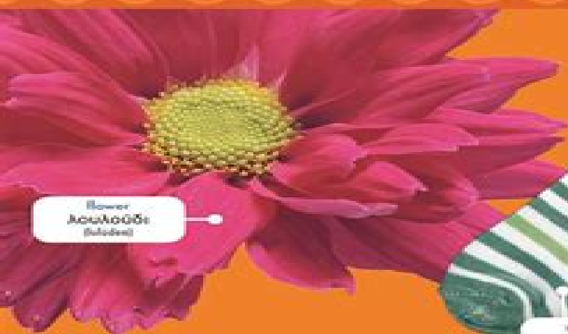
flower λουλούδι (louloudi)