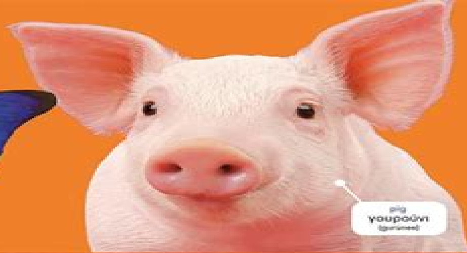
pig γούρουνι (gourouni)