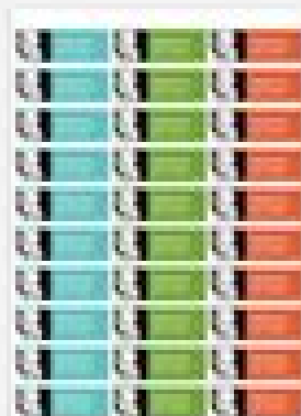
Photo address labels