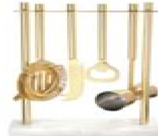
Hester & Cook - Franklin Gold & Marble Bar Set $59