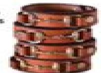
Patina Home & Garden - Leiper's Fork The Horse Bit Napkin Ring $34 each