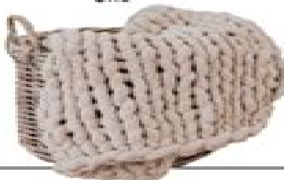
Mercantile 1858 - Arrington Handmade Chenille Woven Throw $119