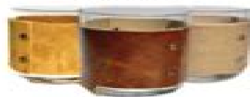
David Arma Gallery - Leiper's Fork Rocks Glass with Handmade Leather Wraps $28 each