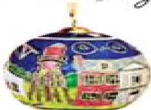
Visitor Center - Franklin Custom Cloisonné Ornament $65