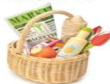
The Purple Butterfly - Franklin Tender Leaf Toys Wicker Shopping Basket $50