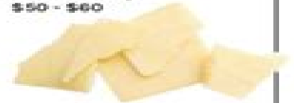
Greys Fine Cheeses - Franklin Cheese Club Subscription $50 - $60