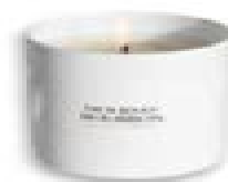
nellamoore - Nolensville Holiday Bourbon Candle $28