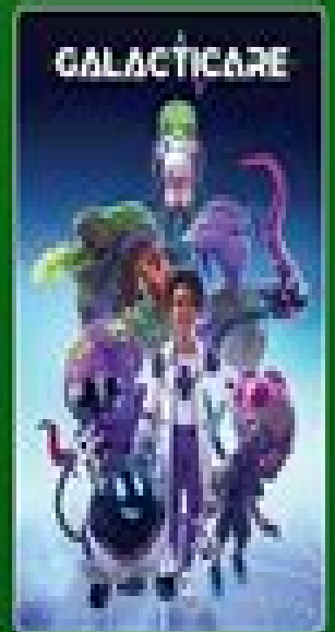
STANDARD Also Series 30