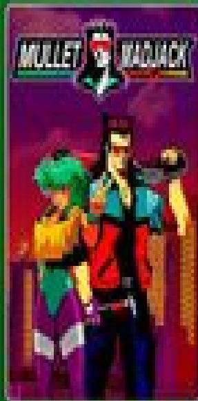
ULTIMATE, PC Also Series 30 • PC • Cloud