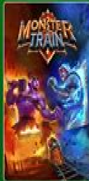
ULTIMATE, PC, STANDARD Console • PC • Cloud