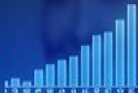
Projected sales of main products in 2011