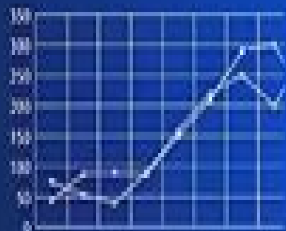
Projected market share