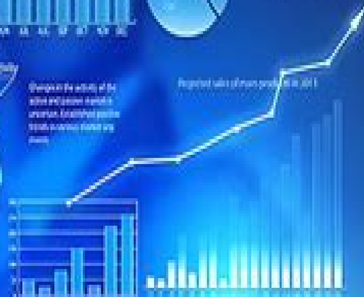
Projected sales of main products in 2011

Comparison of the activity of the major players in the market. The market share of the major players is relatively stable, and the market share of the major players is relatively stable.