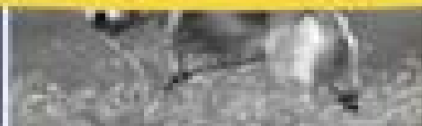
Engaged - Inspired or Hesitant?