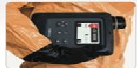
MX908 is continually evolving to go beyond traditional threats by addressing emerging chemical threats such as FGAs and PGAs.