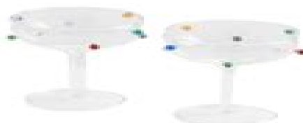
12. CHAMPAGNE COUPES