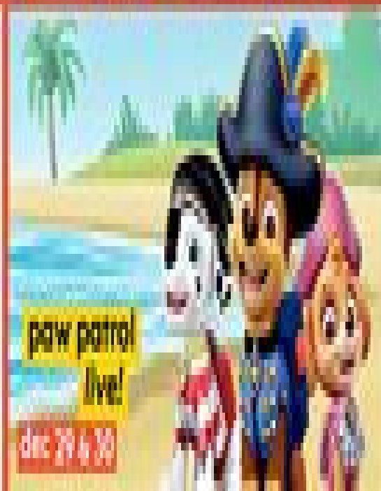
paw patrol live!