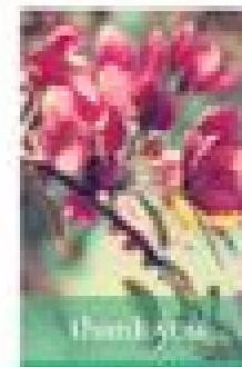
Thank you cards