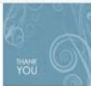
Thank you cards