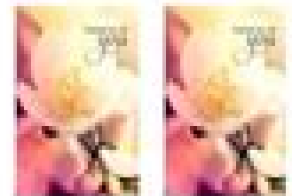
Thinking of you cards