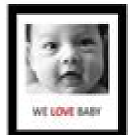
Baby photo album