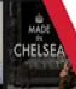
Made in Chelsea