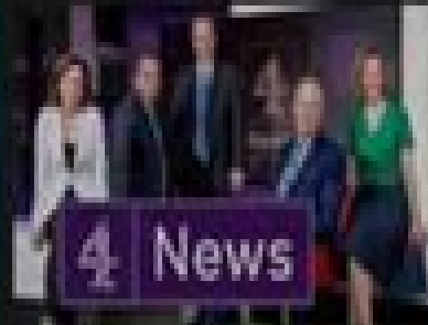
Channel 4 News