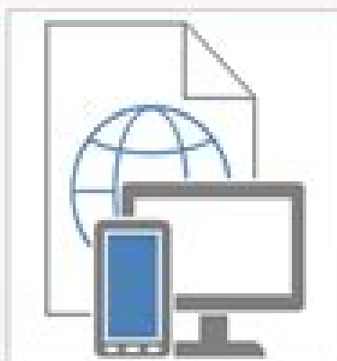
Suivi des biais