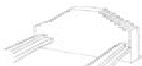
2. SUPPORTING BEAM