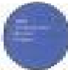
Table 1: Security Domains – An Example Security Guide