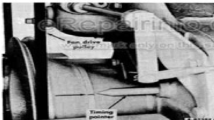
Illustr. 24B Notch on the fan drive pulley and the timing pointer.

If the spark plug cables have been removed for any reason, attach the cables to the spark plugs and to the terminal sockets of the distributor cap in the following order: The No. 1 cylinder spark plug cable to the socket marked "1" in Illustrs. 24 and 24A. Then, going around the distributor cap in a clockwise direction, attach the cable from the No. 3 spark plug to the next or second socket, the cable from the No. 4 spark plug to the next or third socket, and the cable from the No. 2 spark plug to the fourth or last socket. Assemble the secondary cable "A" in the distributor cap. See Illustrs. 24 and 24A.