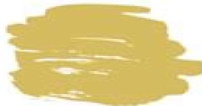
Cadmium Orange Hue