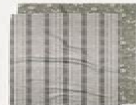
CODE CAMILLA'S FOR 15% OFF