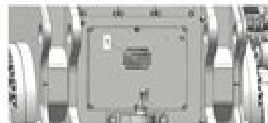
Fig. 443: Reversing alarm