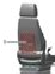
Fig. 441: Storage net