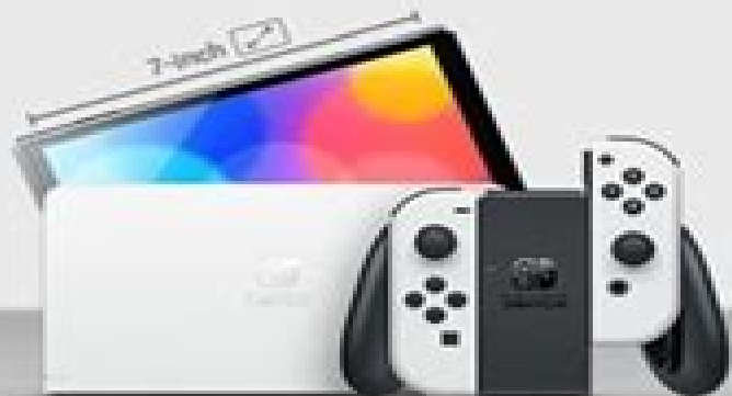
Nintendo Switch OLED Model