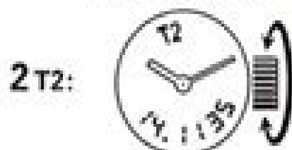
Second time zone