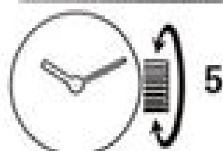
Hours + Minutes (hands)