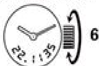
Hours + Minutes + Seconds