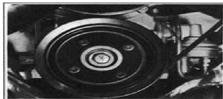
Fig. 6A6-22—Balancer and Pulley

3. Install cylinder head as previously described.