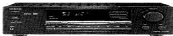
Black, Silver, and Golden models