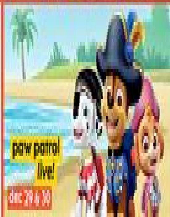
paw patrol live!