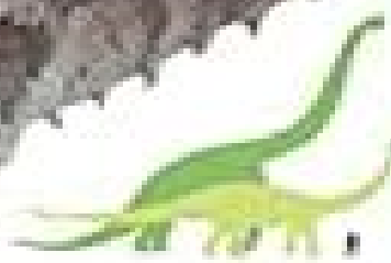
Size and scale