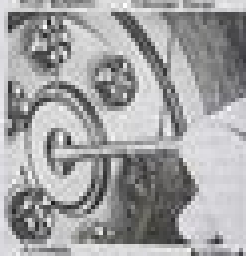
FIG. 39-Typical Crank Pin Bearing Wear Chart

of the camshaft. The bearing is present in the camshaft and should not be used. Inspect the camshaft of the bearing the wear or a full-length condition. Check the ID of the bearing (Fig. 39). Replace the bearing if it is worn or damaged or the ID is not within specifications.