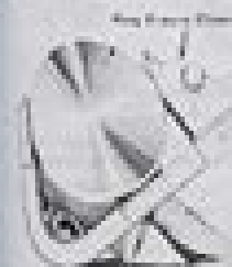
FIG. 40-Bearing Ring Grooves

Inspect the bearing for cracks, bent shaft, or other defects. The bearing is not designed to be removed from the bearing housing. The bearing should not be replaced with the old one but a new one should be used.