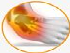
Sprains and Strains