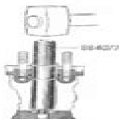
Fig. 7. Pressing in the injector sleeve.

As soon as the thin part of the sleeve is correctly located, drive it into position with a hammer and a drift. (Fig. 7)