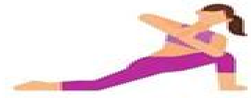
Revolved side angle pose