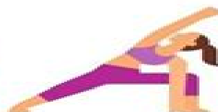
Extended side angle pose