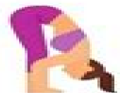
Standing forward bend