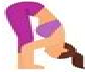
Standing forward bend