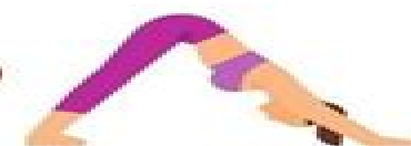
Downward facing dog